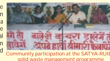
Community participation at the SATYA-RUIDP solid waste management programme

The task of solid waste and garbage collection is being executed as a pilot project, at the behest of the municipal corporation (JMC), in Vaishali Nagar and ward #20 of Jaipur.