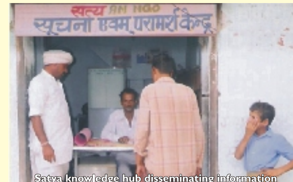
Satya knowledge hub disseminating information

Satya has adopted Panchayat village Teetaria, Chaksu Block and Kapurawala Panchayat village, sanganer block under 'Ek Gram, Ek Sanstha' programme under district development programme of district collector. Under this, organization is nominated to work in 17 enlisted areas for overall integrated development of the Panchayat