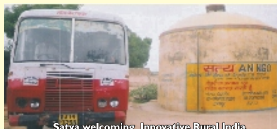
Satya welcoming Innovative Rural India