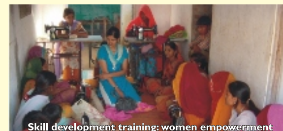
Skill development training: women empowerment