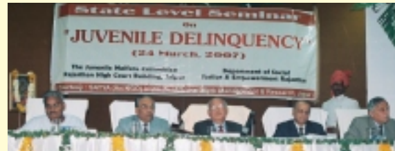
A ONE DAY STATE LEVEL SEMINAR ON JUVENILE DELINQUENCY

A 3-day state level training were organized with an objective to facilitate the effective implementation of Juvenile Justice (Care and Protection of Children) Act, 2000 and Capacity-Building through knowledge Dissemination on theoretical and behavioral aspects, generating awareness on the issue on state level in districts of Jaipur and Udaipur