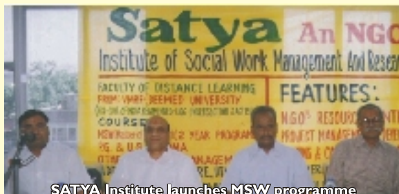
SATYA Institute launches MSW programme

Specialized programmes to pursue the right to free and universal primary education are underway for the urban poor living in Jaipur-based slums of Sanjay Nagar and Manoharpura kachhi basti.