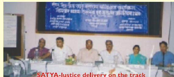
SATYA-Justice delivery on the track

A 3-day state level training were organized with an objective to facilitate the effective implementation of Juvenile Justice (Care and Protection of Children) Act, 2000 and Capacity-Building through knowledge Dissemination on theoretical and behavioral aspects, generating awareness on the issue on state level in districts of Jaipur and Udaipur